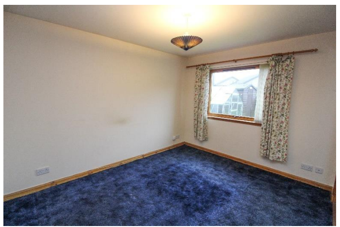
Approx. 3.7m \times 3.73m . Spacious double bedroom. Double glazed window to rear. Double mirror fronted wardrobes.