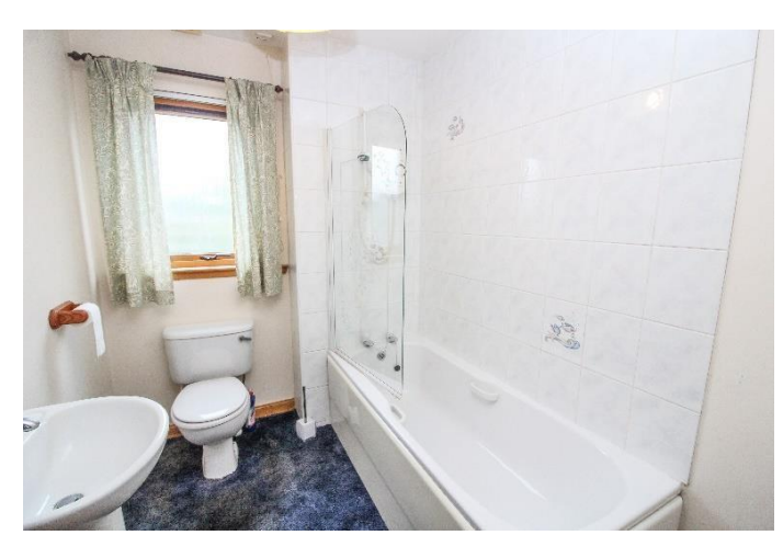
Approx. 2.53 \text{m} \times 1.9 \text{m} . Three piece suite comprising WC, wash hand basin and bath. Shower over bath with shower screen. Double glazed frosted window to rear. Extractor fan.