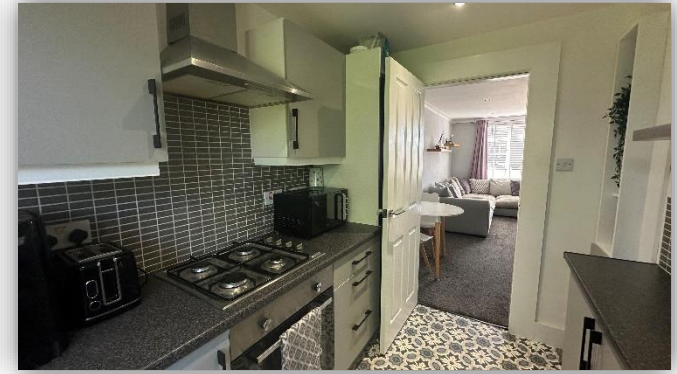
GROUND FLOOR 65.0 sq.m. approx.