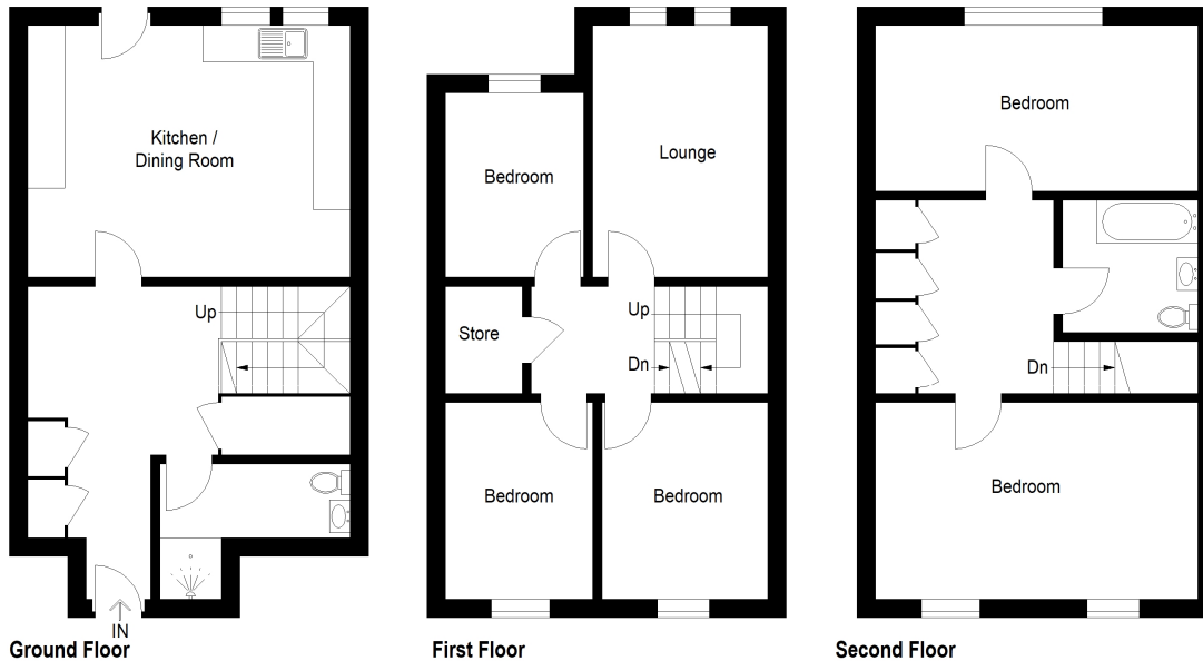
Illustration For Identification Purposes Only. Not To Scale (ID:1079638 / Ref:87983)