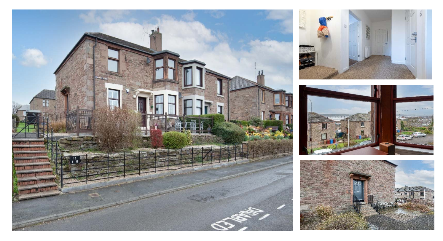
"Lovely Quiet Location With Outstanding River Views"

Accommodation: Entrance Hall, Lounge, Kitchen, 2 Double Bedrooms, Bathroom, Double Glazing, Gas Central Heating, Gardens.