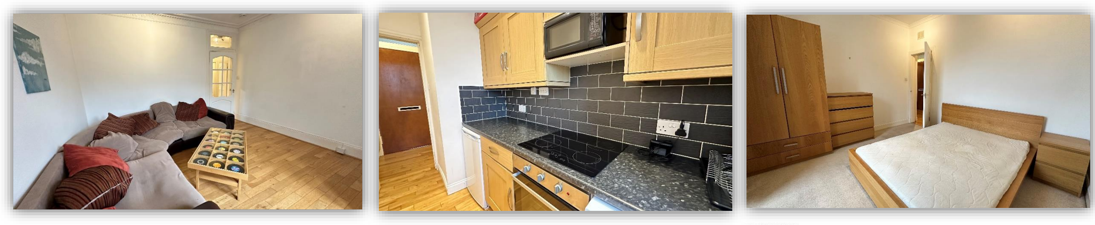
GROUND FLOOR 41.0 sq.m. approx.