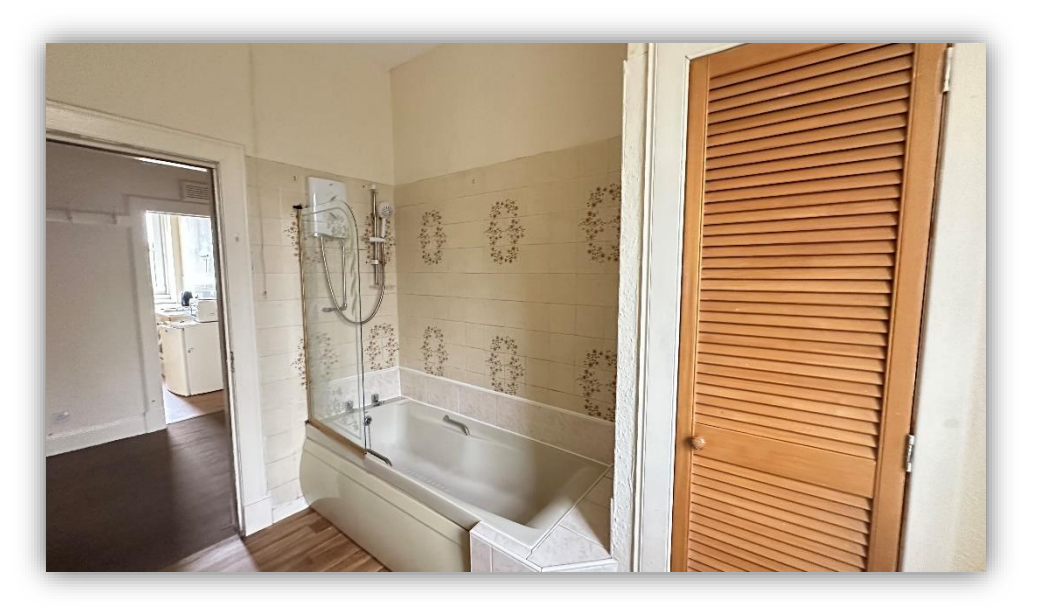
GROUND FLOOR 66.0 sq.m. approx.