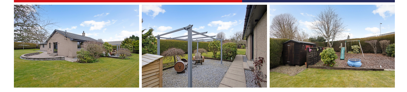
SUPERIOR DETACHED BUNGALOW