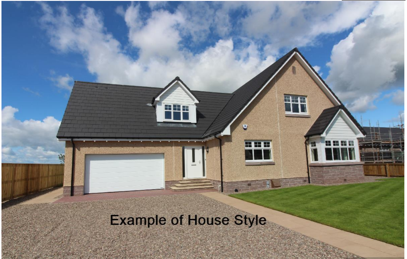
Example of House Style

10 Falcon Drive, Strathmore Fields, Forfar DD8 3FU