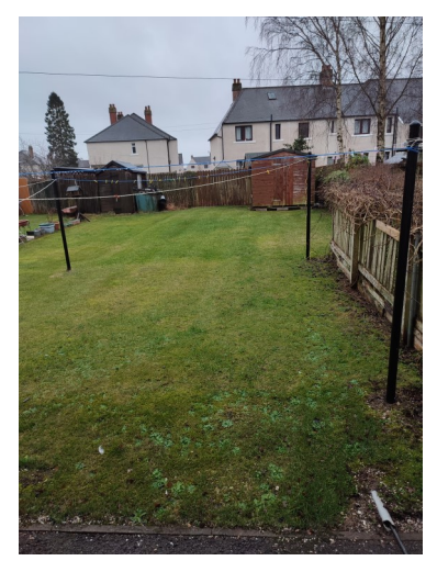
Illustration For Identification Purposes Only. Not To Scale (ID1028639 / Ref:86678)