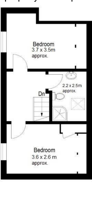
Illustration For Identification Purposes Only. Not To Scale (ID:1023668 / Ref:86556)