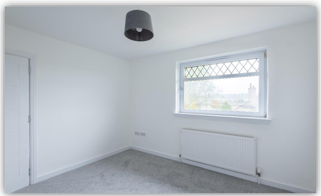
GROUND FLOOR 33.0 sq.m. approx.