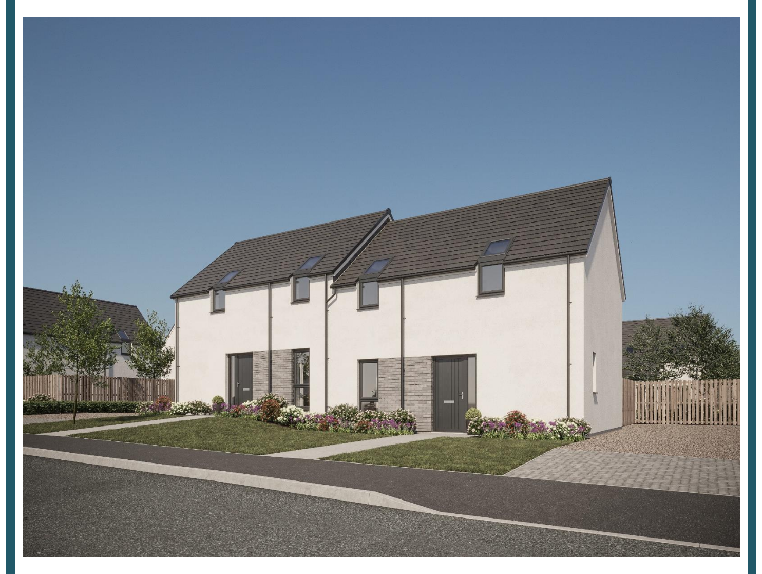
3 Hampton Gray Way, Brechin West, Brechin, DD9 6FD

Estate agency division of Jack Brown & Company Solicitors