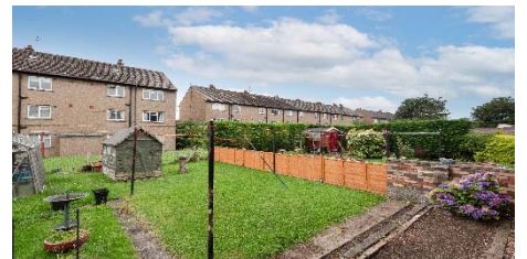
"Spacious Mid Terraced Villa In Popular Residential Area"

Accommodation: Hall, Lounge/ Dining, Kitchen, 3 Bedrooms, Shower-Room, Double Glazing & Gas Central Heating. Gardens.