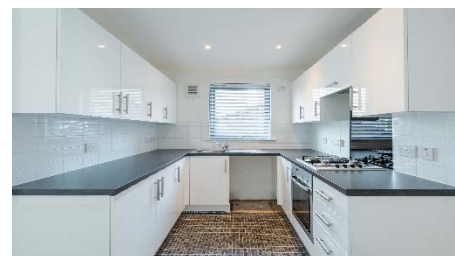
"Modern Spacious Main Door Ground Floor Flat in Central Broughty Ferry"

Accommodation: Hall, Lounge/ Dining, Kitchen, 2 Bedrooms and Bathroom. Side Entrance Porch, 2 Double Bedrooms one with large Storage Area, Bathroom, GCH, DG. Gardens