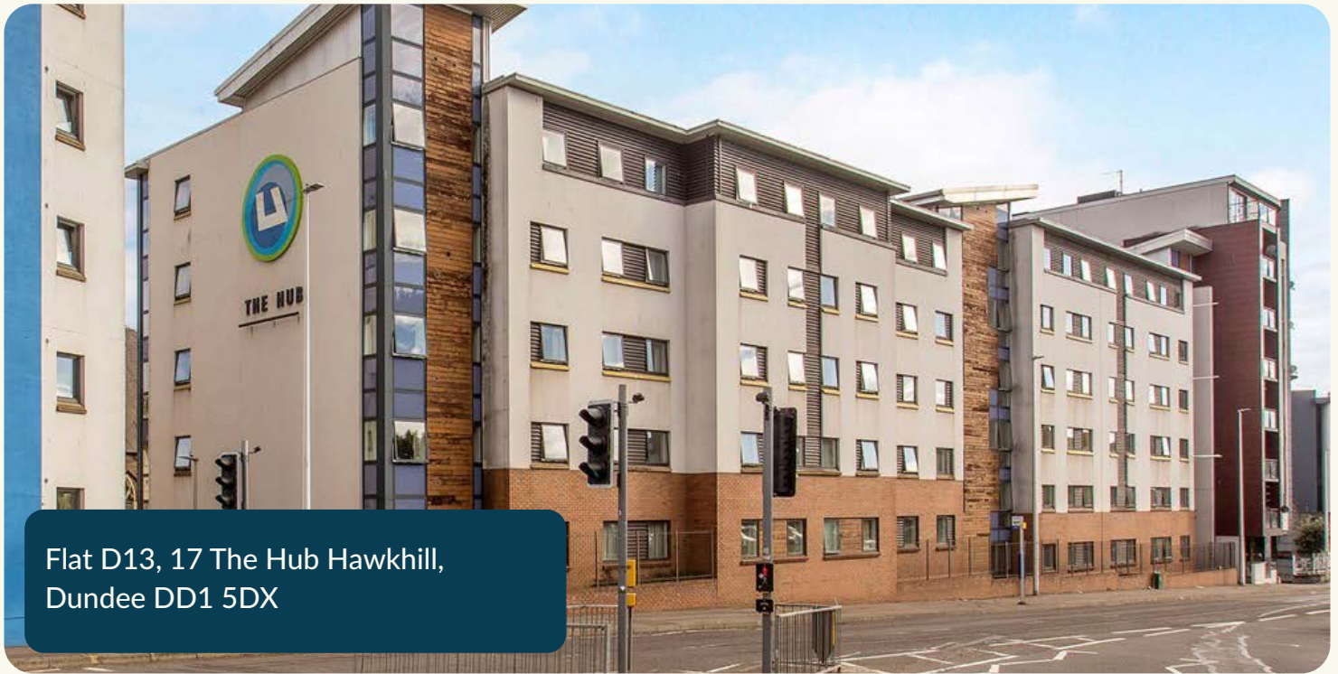
Flat D13, 17 The Hub Hawkhill, Dundee DD1 5DX