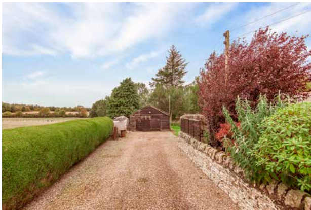
Workshop/ Garage Approx. 39.7 sq. metres (427.3 sq. feet)