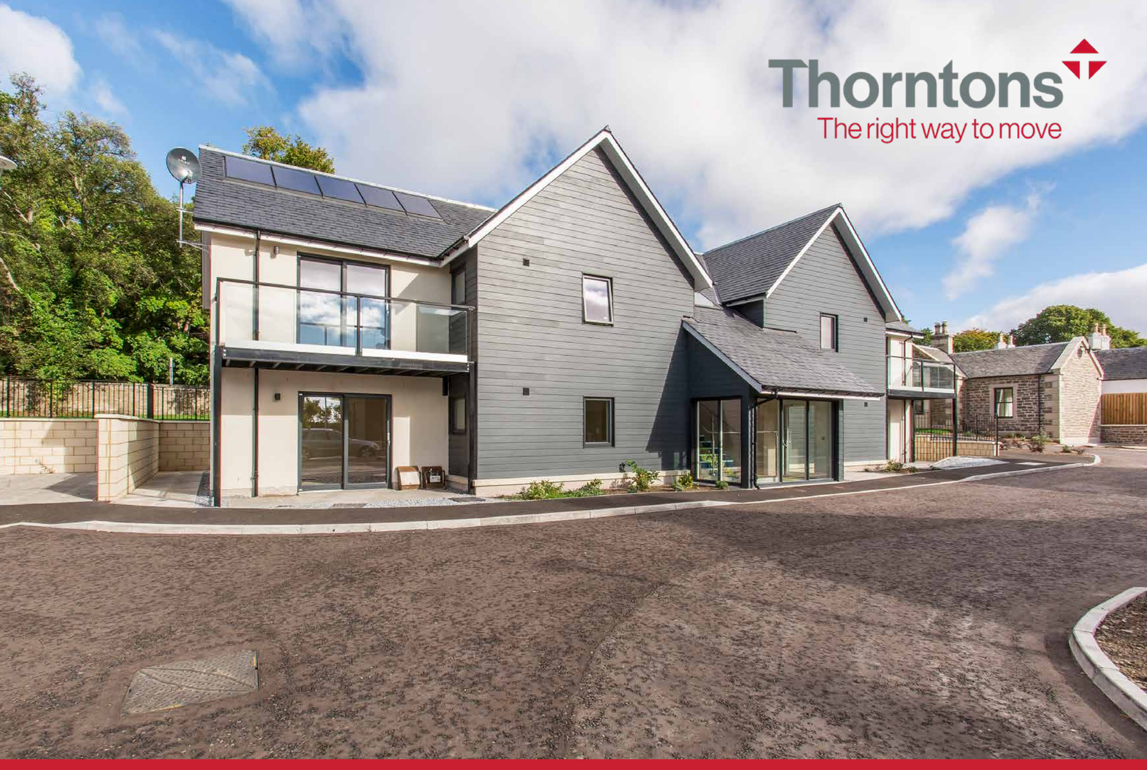
Flat 2, Block A, Armitstead House Monifieth Road, Broughty Ferry, Dundee, DD5 2SJ