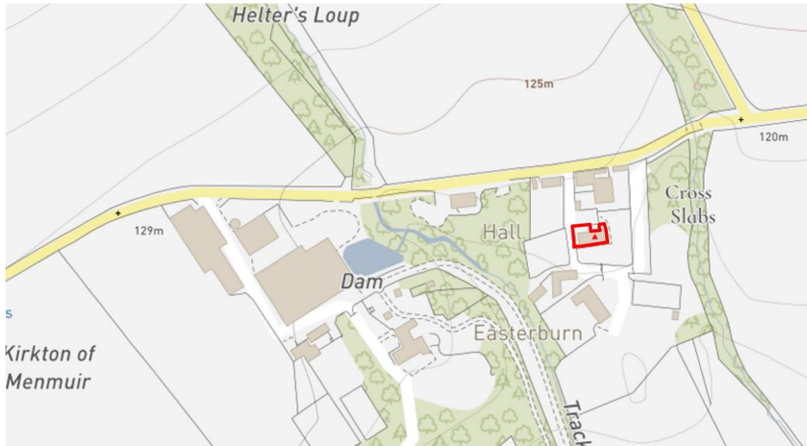
Former Church at Kirkton of Menmuir