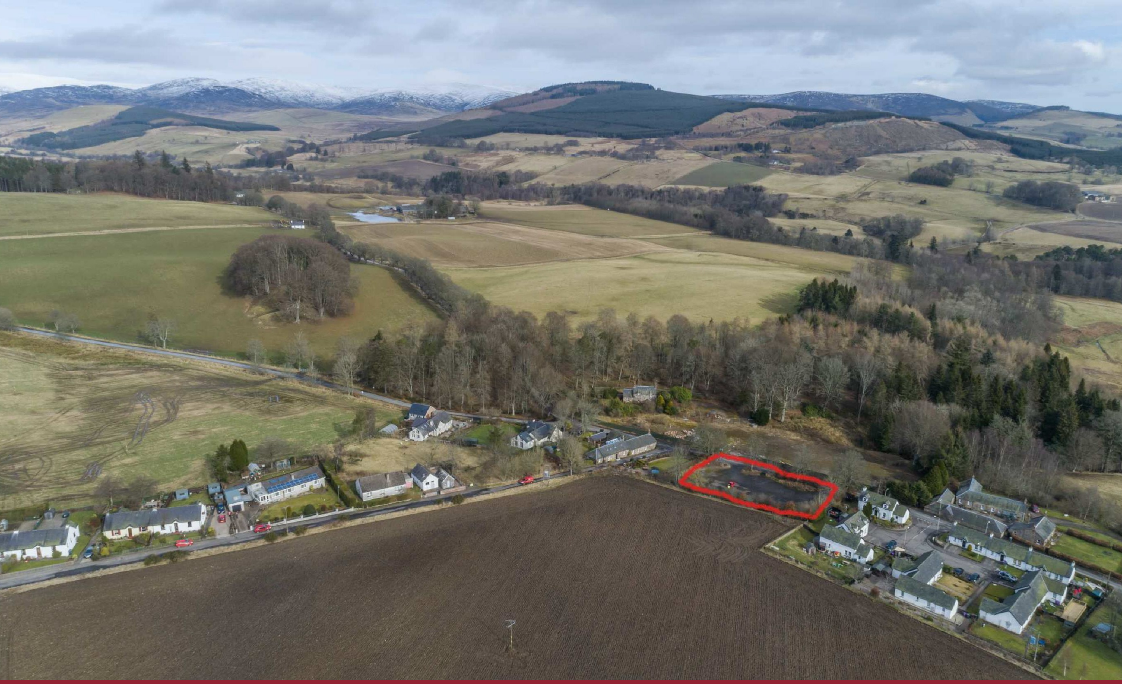
Development Site, Land Opposite Former Jubilee | Dykehead | DD8 4QN