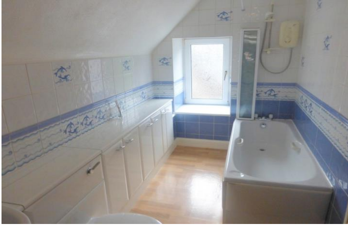
Bathroom 3.2m x 1.8m

Modern fitted bathroom with white suite which comprises back to wall toilet, vanity style wash hand basin with wall-to-wall low-level storage and bath with Mira Sprint electric shower fitment and folding glazed shower screen. There is ceramic tiling to ceiling height on all four walls, vinyl flooring, heated towel rail, shaver point.