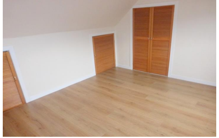
Bedroom Three 3.3m x 3.2m

This is an ideal guest or family bedroom which is located on the upper floor. It enjoys a westerly aspect towards the Castle and Cathedral.