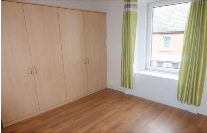
Bedroom One 3.5m x 3.2m

Modern fitted bathroom with white suite which comprises back to wall toilet, vanity style wash hand basin with wall-to-wall low-level storage and bath with Mira Sprint electric shower fitment and folding glazed shower screen. There is ceramic tiling to ceiling height on all four walls, vinyl flooring, heated towel rail, shaver point.